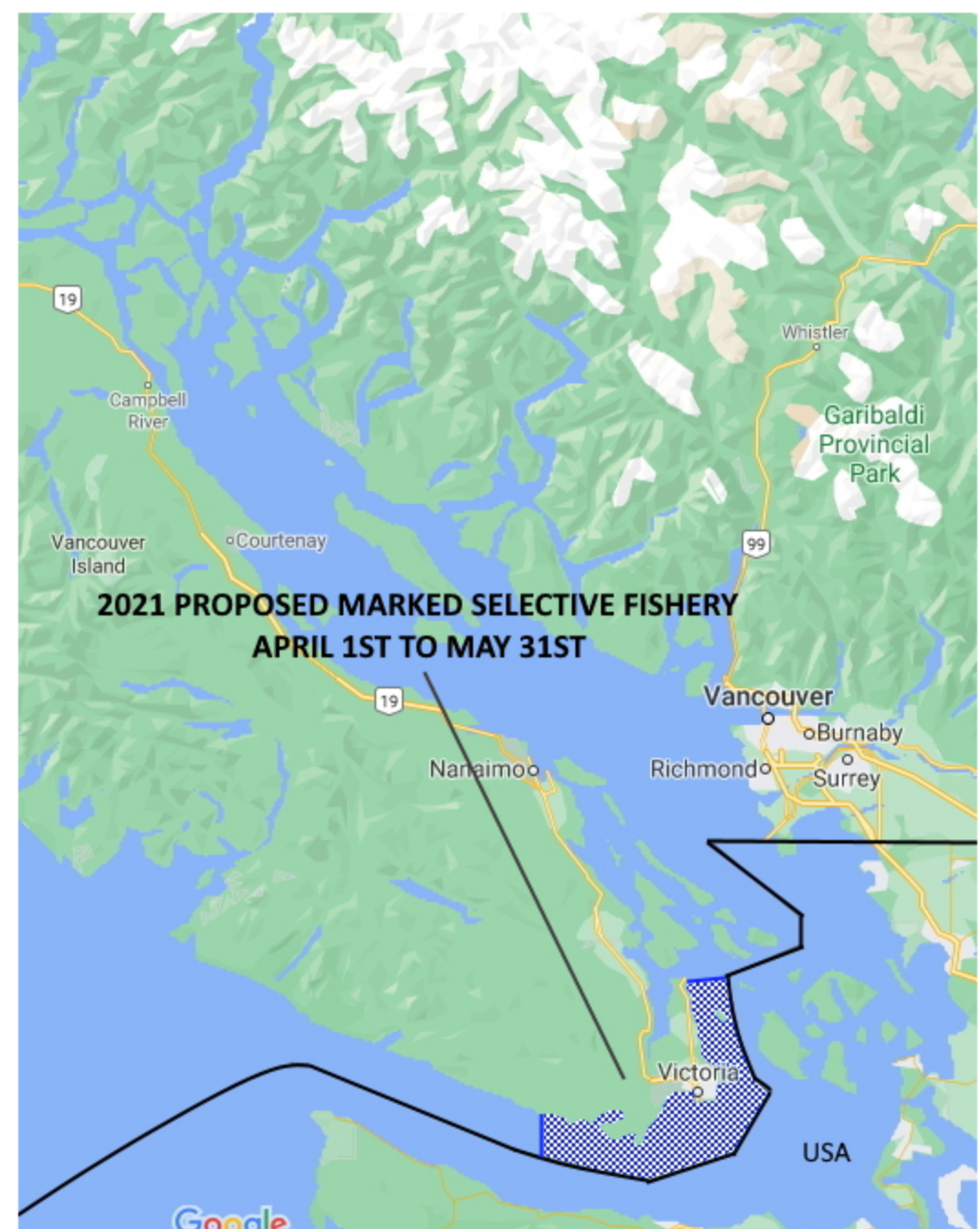
2021 SFAB HATCHERY CHINOOK RETENTION AREA REQUEST