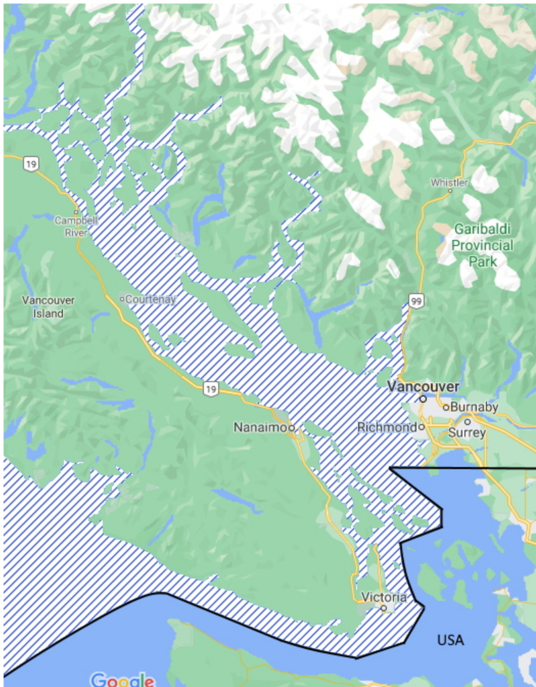
2018 CHINOOK FISHING SHOWN AS STRIPED AREA