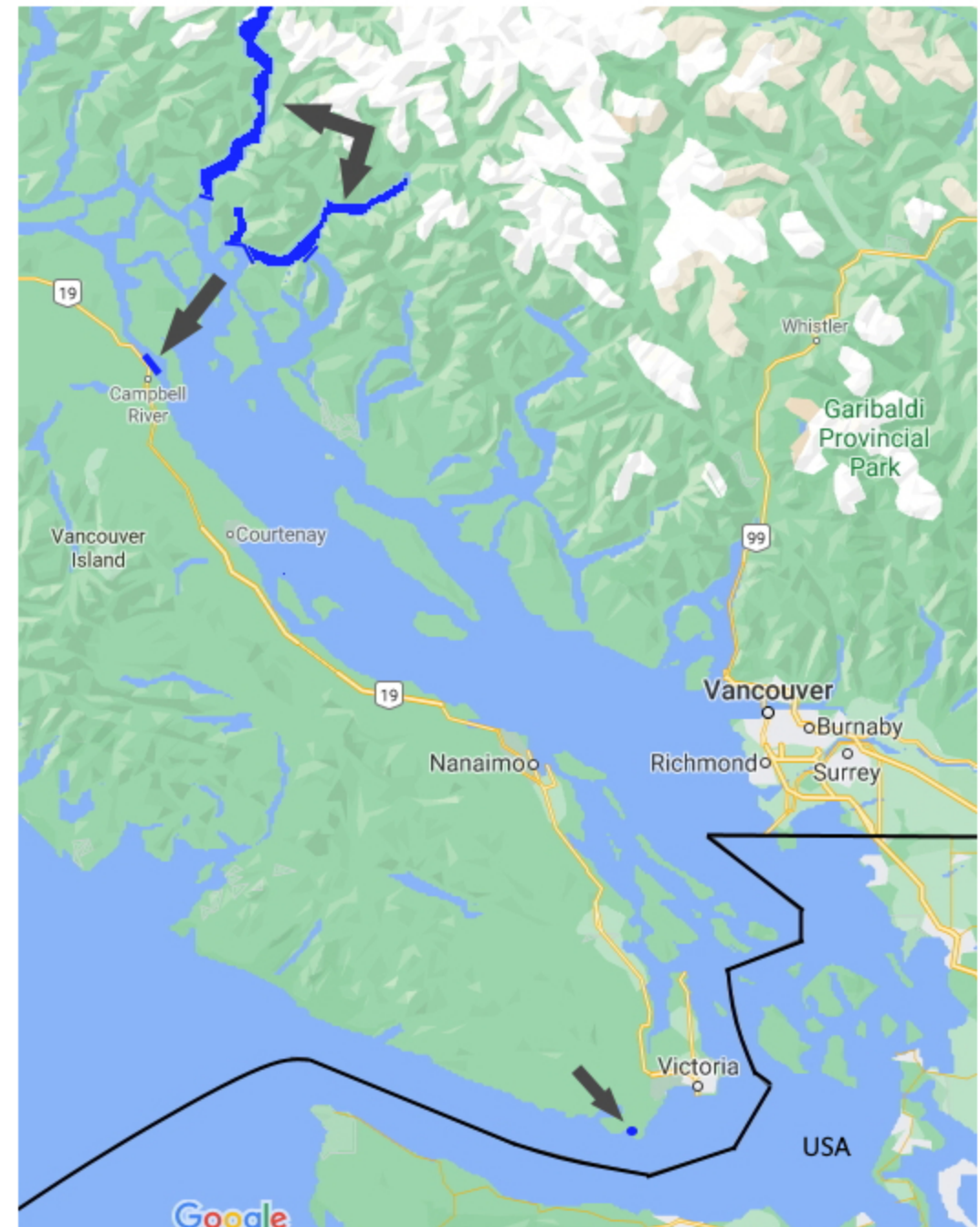
2020 DFO APPROVED CHINOOK RETENTION AREAS